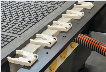
THE SR-3015P FEATURES AN 8-STATION LINEAR TOOL CHANGER FOR OPTIMIZED TOOL CHANGES AND FASTER CYCLE TIMES.

Haas SR Series sheet routers are affordable alternatives to gantry-style milling machines for cutting lighter materials, such as wood, plastics, high-density foam, and composites. Powered by the industry-leading Haas control, SR Series routers provide a level of programmability and functionality not found in other CNC routers.